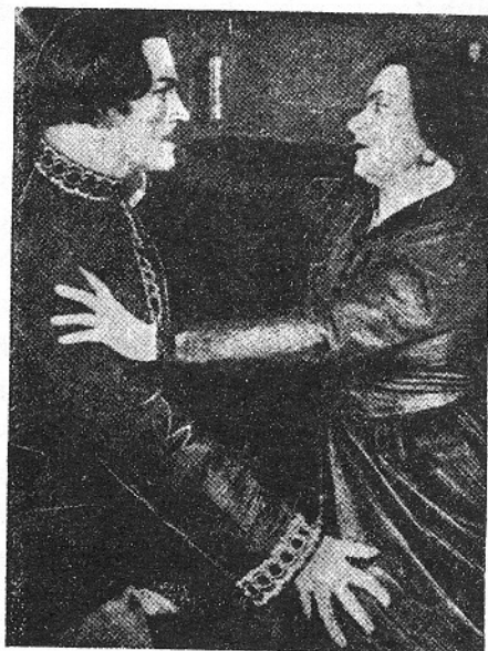
Katerina and her lover, Sergei