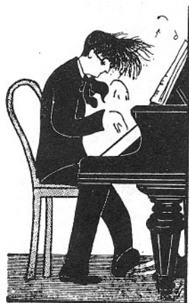
DMITRI SHOSTAKOVITCH Caricature by IRINA SCHMITT

The illustrations on this page are of the Nemirovitch Dantchenko production staged last spring in Moscow. On February 5th the Cleveland Orchestra, under the auspices of the League of Composers, will present the only New York performance of this work at the Metropolitan Opera House. Artur Rodzinski will direct this as well as two earlier performances in Cleveland, where the work will receive its premiere.